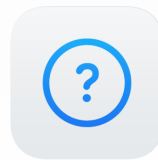
Resources and Help