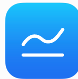
Sales and Trends