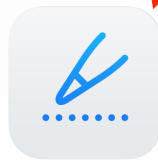
Agreements, Tax, and Banking