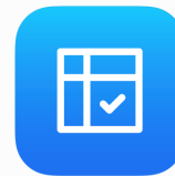
Payments and Financial Reports